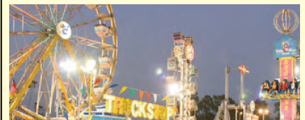
RIDES AND ENTERTAINMENT FRIDAY-SATURDAY-SUNDAY